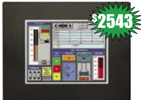
15" TFT Color, VGA EZP-T15C-FS-PLC: $2543