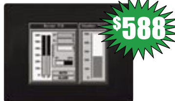
6" Monochrome, QVGA EZP-S6M-FS-PLC: $588