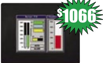
6" TFT Color, QVGA EZP-T6C-FS-PLC: $1066