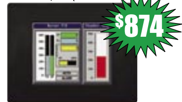
6" STN Color, QVGA EZP-S6C-FS-PLC: $874