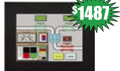
8" TFT Color, VGA EZP-T8C-FS-PLC: $1487