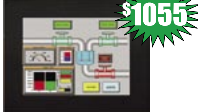
8" STN Color, VGA EZP-S8C-FS-PLC: $1055