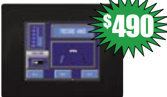
6" White on Blue, QVGA EZP-S6W-RS-PLC: $490